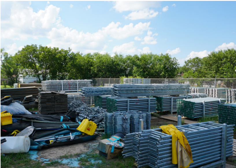
Scaffolding necessary for massive interior spaces

A 2.5 million gallon ground storage potable water tank in Brownwood, TX was in need of rehabilitation due to pinholes in the base plate and a failing existing liner. The specification called for the installation of a new NSF/61 approved potable water polyurea lining system. The project was completed using VersaFlex Incorporated's AquaVers® 405 by Chad Corbin and his team of All Seasons Foam and Coating in Sanger, TX.