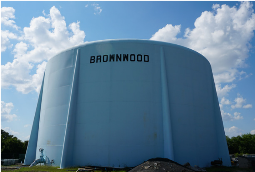
2.5 Million Gallon Potable Water Storage Tank

Potable Water Storage AquaVers® 405 2.5 Million Gallon Potable Water Storage Tank Rehabilitation City of Brownwood, Texas All Seasons Foam & Coatings, Sanger, Texas