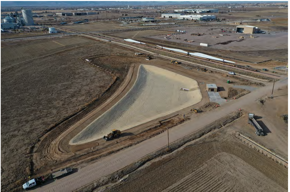
Before (top) – After (bottom)