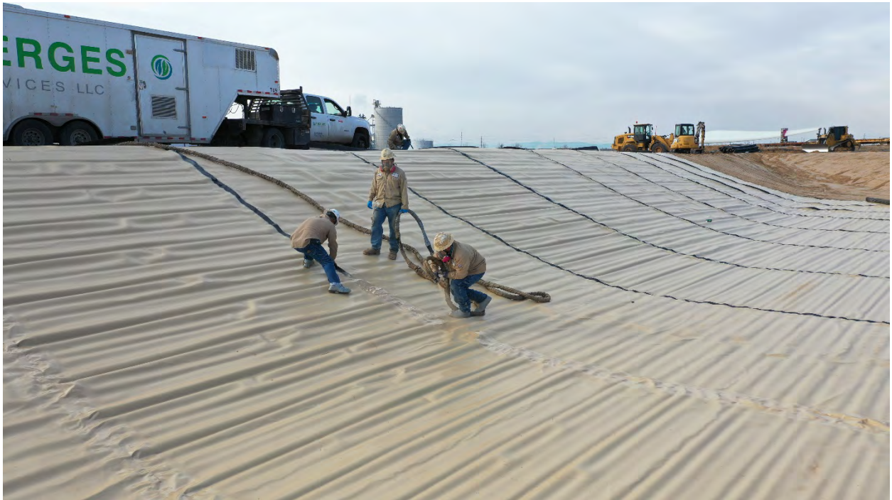
Anchoring the panels (top) – Adhering the panel seams (bottom)