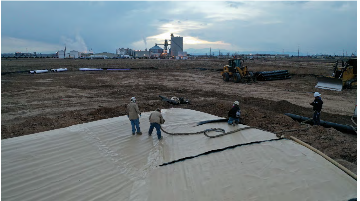
Panel Positioning (top) – Adhering the panel seams (bottom)