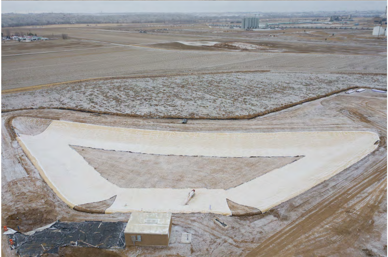
Installation progression Day 4 of 6 (top) – Snowy weather delay (bottom)