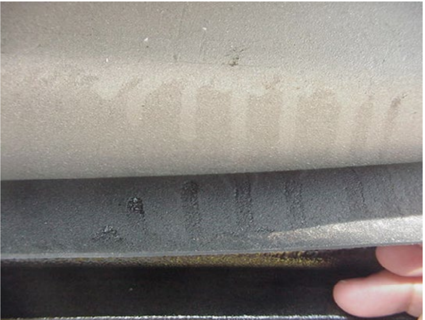
Figure 4: Delamination of Polyurea of Non-removed Soluble Salt Treatment

The following Figure 4 shows where a polyurea elastomer coating system was applied to a properly prepared aluminum substrate that had been treated with the soluble salt removal system. Failure to properly remove the soluble salt treatment system resulted in residual product on the substrate. This then led to easy delamination of the polyurea coating system.