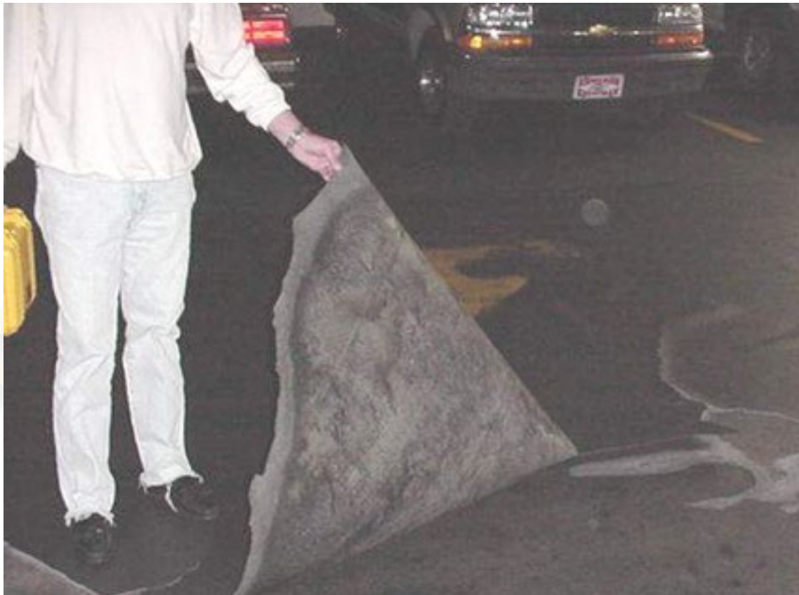
Figure 6: Casino Parking Garage Failure

Whatever the coating / lining project for concrete is, a simple sweeping of that substrate will not be enough. Figure 6 shows a failure of a polyurea system applied to a major casino parking garage where the surface preparation was a simple sweeping of dirt from the substrate, and no use of a primer.