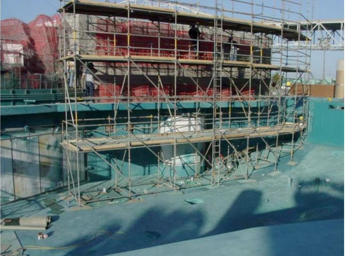
Figure 2: Scaffold Erection in Coating Application Area

One of the most important items in this section will also address safety and hazard issues associated with this project. This would include projects that require work in high spaces where fall protection is required. Also common for polyurea coating / lining projects is work in confined spaces. All of these safety issues are regulated by OSHA, EPA, NIOSH and local regulations.