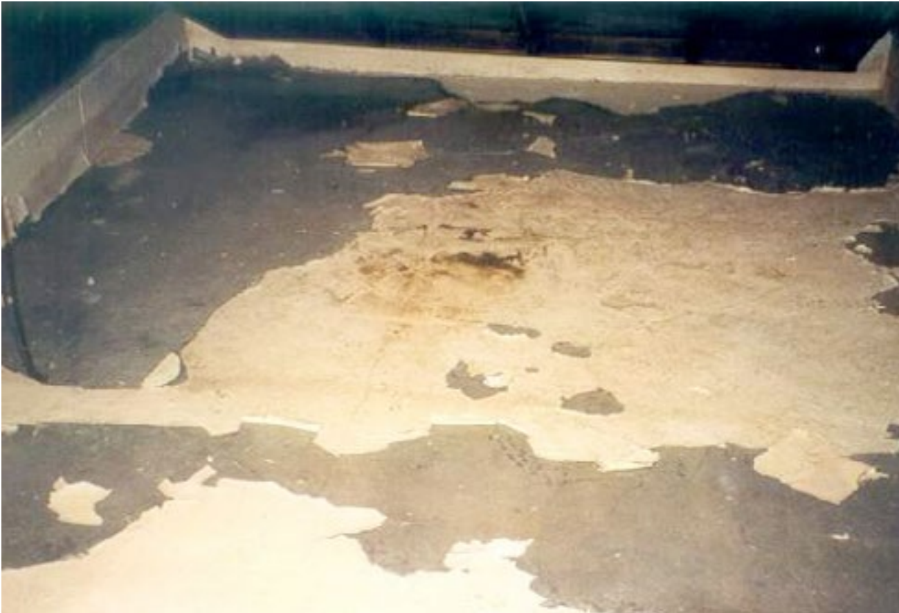
Figure 3: Disbonding of the polyurea system