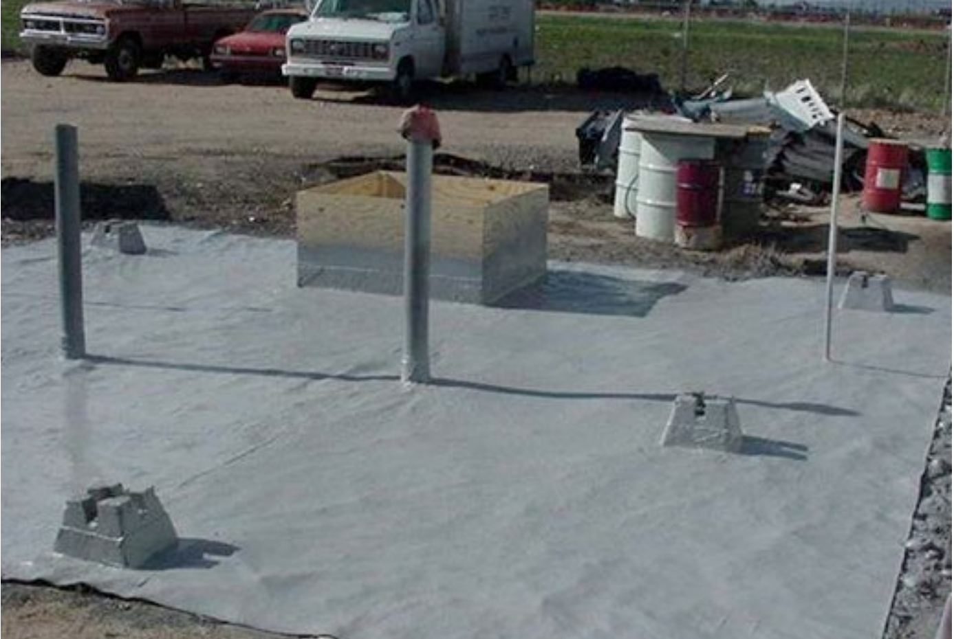
Figure 1: Mock-up Area for Landfill Lining Application