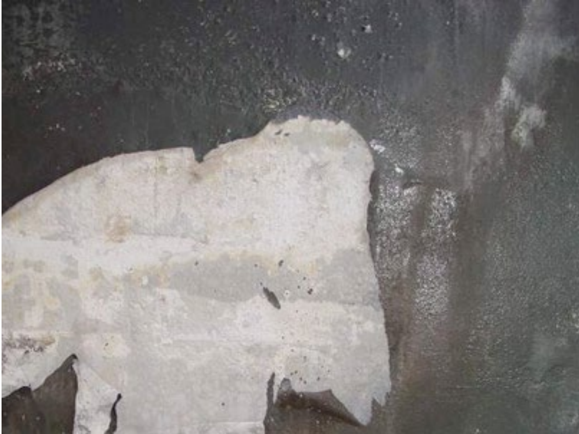
Figure 7: Lift Station failure