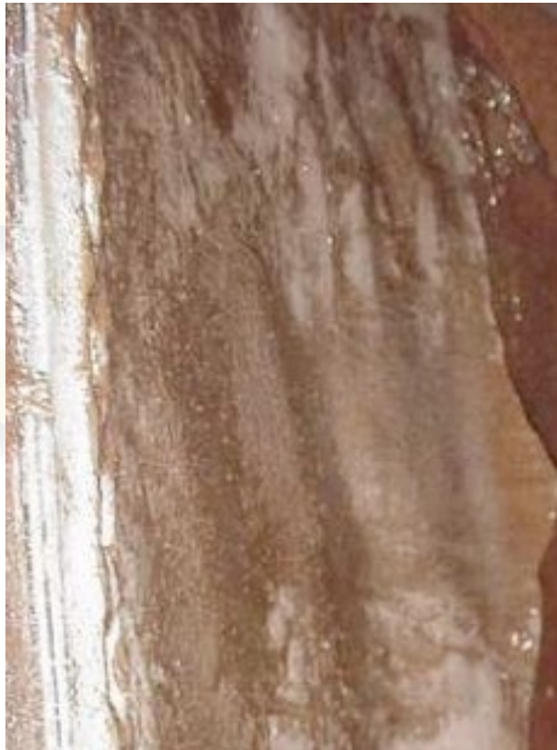
Figure 5: Wastewater tank lining failure

In the case of steel coating / lining work, a form of abrasive blasting is commonly required to create a surface profile to allow for mechanical adhesion. This is extremely important in lining application work. Don not use a low-pressure water blast procedure as this may merely just “clean” the surface. Figure 5 shows a bolted wastewater storage tank lined with polyurea that failed within a couple weeks. Only a water wash technique was used and the polyurea applied over rust.