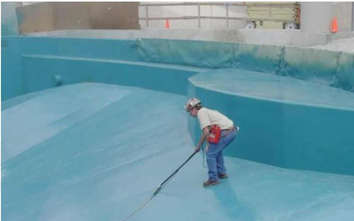
Figure 8: Spark Testing of a Polyurea Lining Project

However, testing was done after the application of the topcoating system and numerous holidays were found. This then required sanding off of the topcoat, reapplication of the base coat in some areas, direct treatment of some of the void areas followed by reapplication of the topcoating system. A very expensive and project delaying operation.